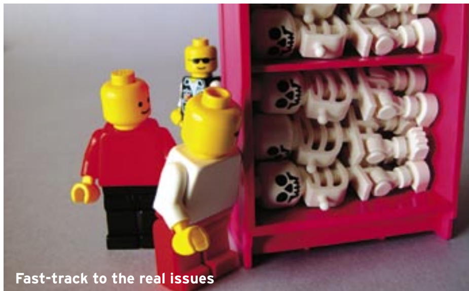
Fast-track to the real issues

Using LEGO SERIOUS PLAY, participants will be clearer on objectives, actions and on the Simple Guiding Principles for the organization. Consequently, business strategies will be much more comprehensive and coherent - and in a deeper way that creates actionable ideas.